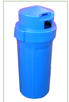
Battery Storage Unit