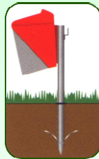
Soft Gr. Post