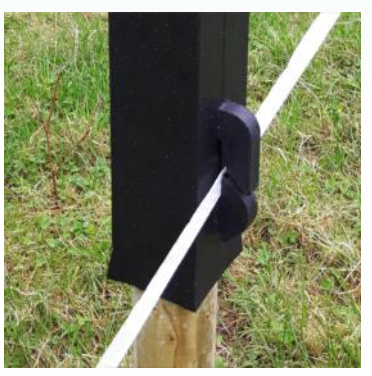
Suitable for Electrical Tape