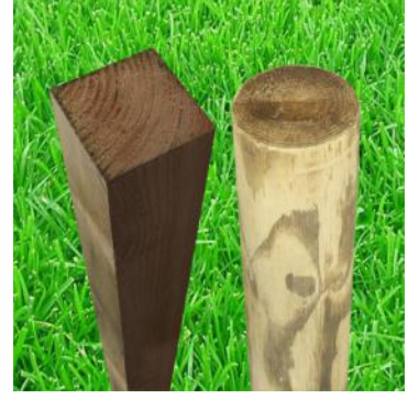
Suitable for 3" Square or Round Posts