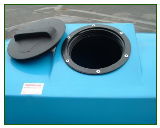
200mm Screwed Lid Opening